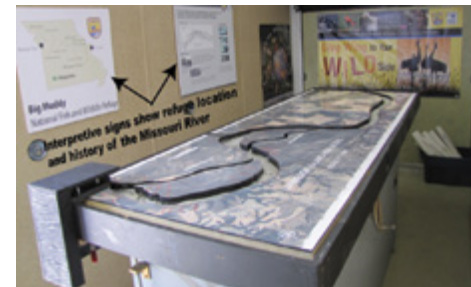
A look inside the Big Muddy Mobile Visitor Center.

The Opening Ceremony will commence at 10 a.m. and the Conservation Awards will take place on the stage near the Food Court at noon. New this year, Big Muddy National Fish and Wildlife Refuge will have a Mobile Visitor Center parked outside near Jared's Jewelry. Participants are invited to tour the Visitors Center throughout the event to learn more about the organization's commitment to conserving America's fish, wildlife, and plants.