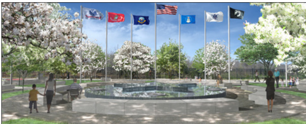
Veterans Honor Park is funded in part by the generous individual and corporate donors, as well as the major donor, AEP River Operations.