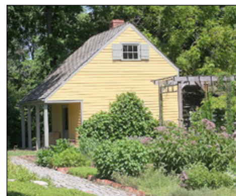
Summer kitchen gardens shown above.