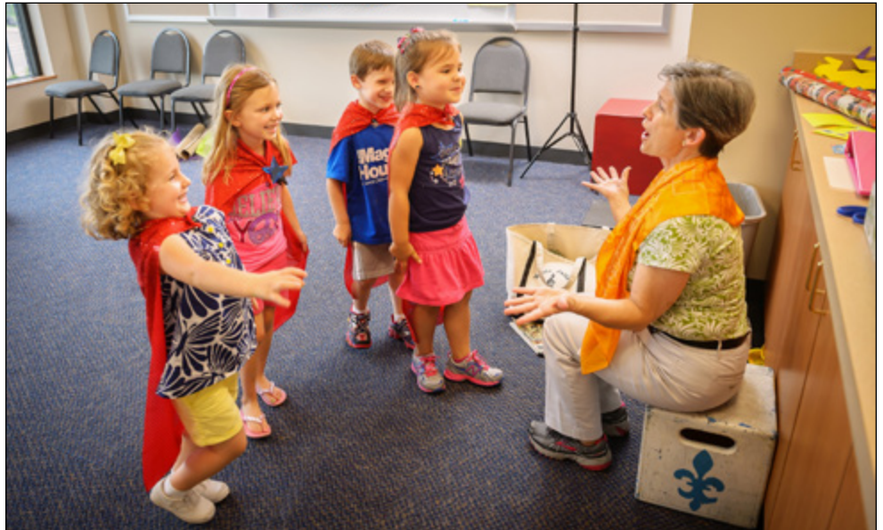
STAGES' unique Summer Performance Workshops will include timeless classics like "Willy Wonka KIDS" and "Footloose."

Tickets and additional information are available at stlco.org or email stlcivicorch@gmail.com to receive concert announcements and newsletters.