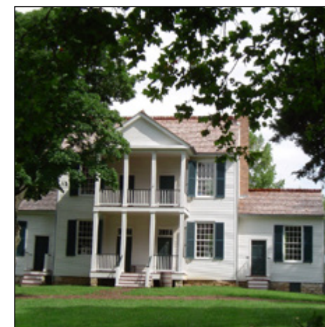
Thornhill Estate Open House is free to attend.

Saturday & Sunday April 23 & 24, May 7 & 8, May 14 & 15, August 27 & 28 1-5 p.m. Faust Park Thornhill Estate Free for all ages