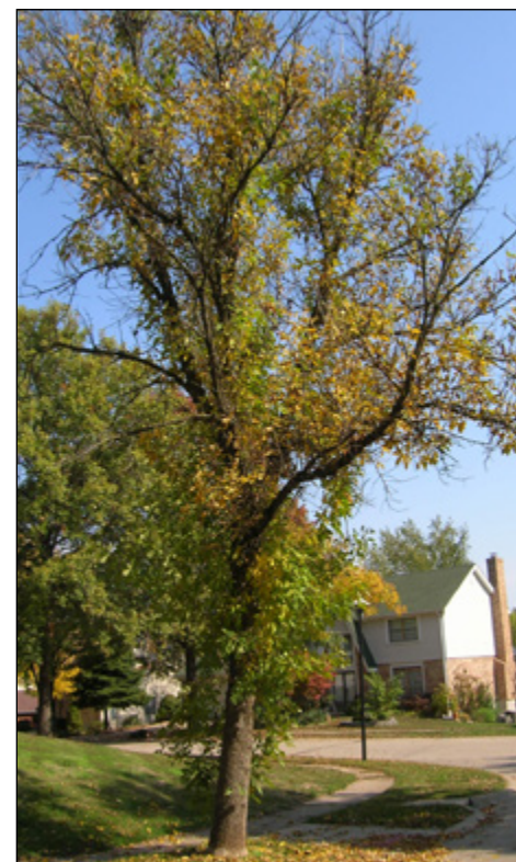
The Emerald Ash Borer (EAB) is an exotic wood boring beetle that was first discovered destroying Ash trees in Michigan in 2002. EAB kills Ash trees by damaging the sapwood and preventing fluid transport throughout the tree. Once infested, trees usually die within 3-5 years. Ash trees are the only species at risk from this insect.

The City has a Residential Street Tree Planting program to assist homeowners who would like to plant a replacement tree within city right of way. Trees must be of an approved species to ensure the tree can thrive and ultimately help improve the overall health of our Urban Forest. To learn more about the Emerald Ash Borer and the City's Action Plan, visit chesterfield.mo.us/residential-street-tree.html .