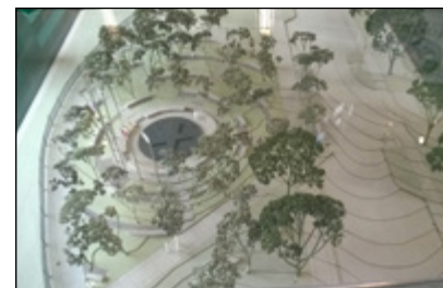
A model of the park is on display in the lobby at City Hall.

The project will be completed in two phases; Phase One will include the heart of the park design; granite monument fountain, military seals and threshold pavers, paved sidewalks, inner ring precast benches and flagpoles. Phase Two of the construction will enhance the street approach by creating a sanctuary occupied by arcing benches orbiting around a central monument fountain to provide a calm yet engaging space for the community to honor and recognize veterans.