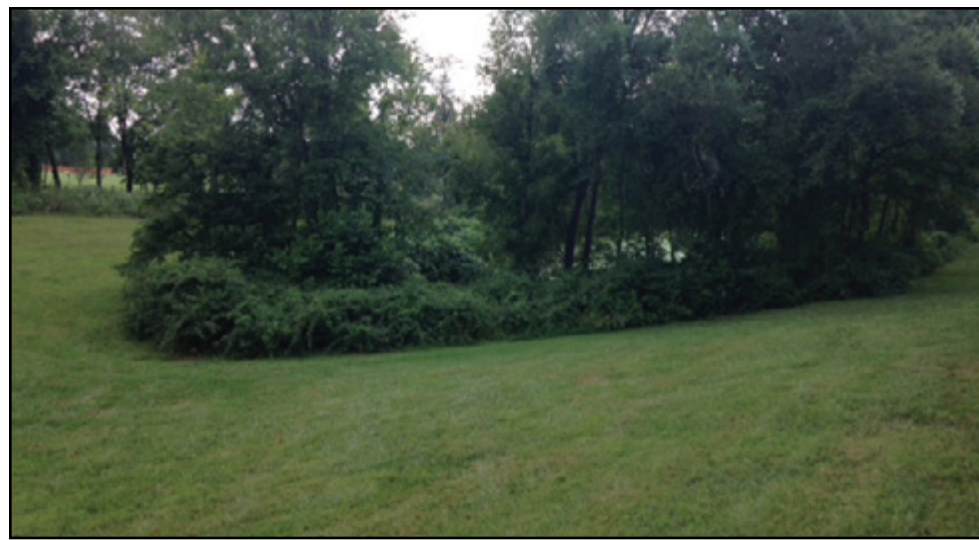
BEFORE: Eberwein Park pond previously hosted a number of undesirable bushes and shrubs.

There will also be donation opportunities at local events and recreation facilities. Look for the logo next to the event, recreation program or facility flyer.