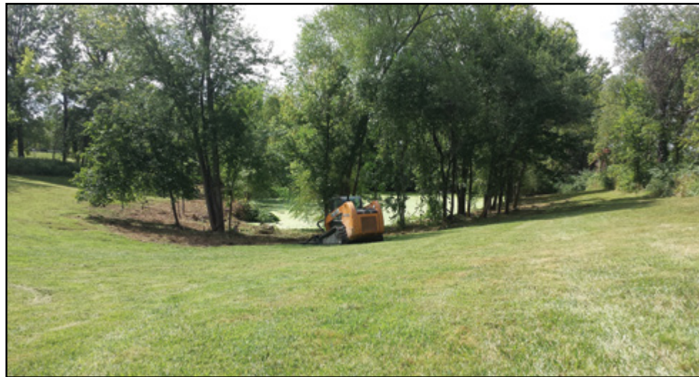
AFTER: The removal of the invasive bush honeysuckle will make room for native plant species.