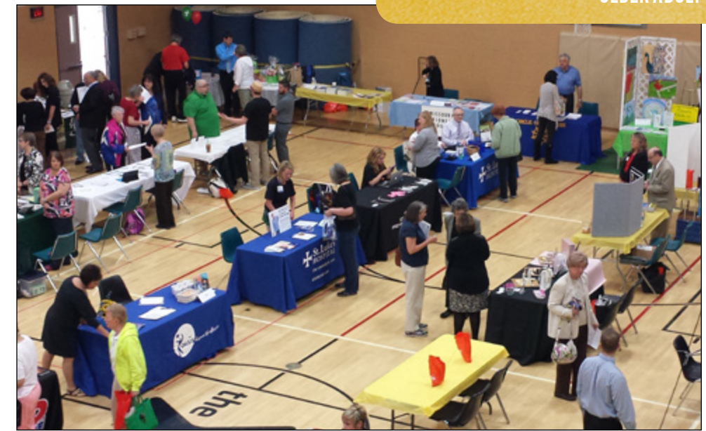
The Sampler has over 40 vendors specializing in health, wellness and services for older adults.

For more information about this event, call 636.537.4000.