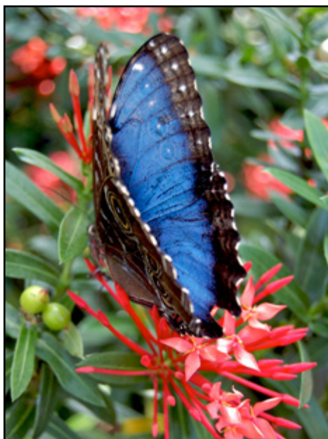
March Morpho Mania brings nearly 3,000 Blue Morpho butterflies to the Conservatory.

Celebrate the important insects that help to make the gardens grow! Each week will highlight a different beneficial insect through fun facts, crafts, games, and other family friendly activities. Come and learn more about a different pollinator each weekend! All activities are included with regular admission.