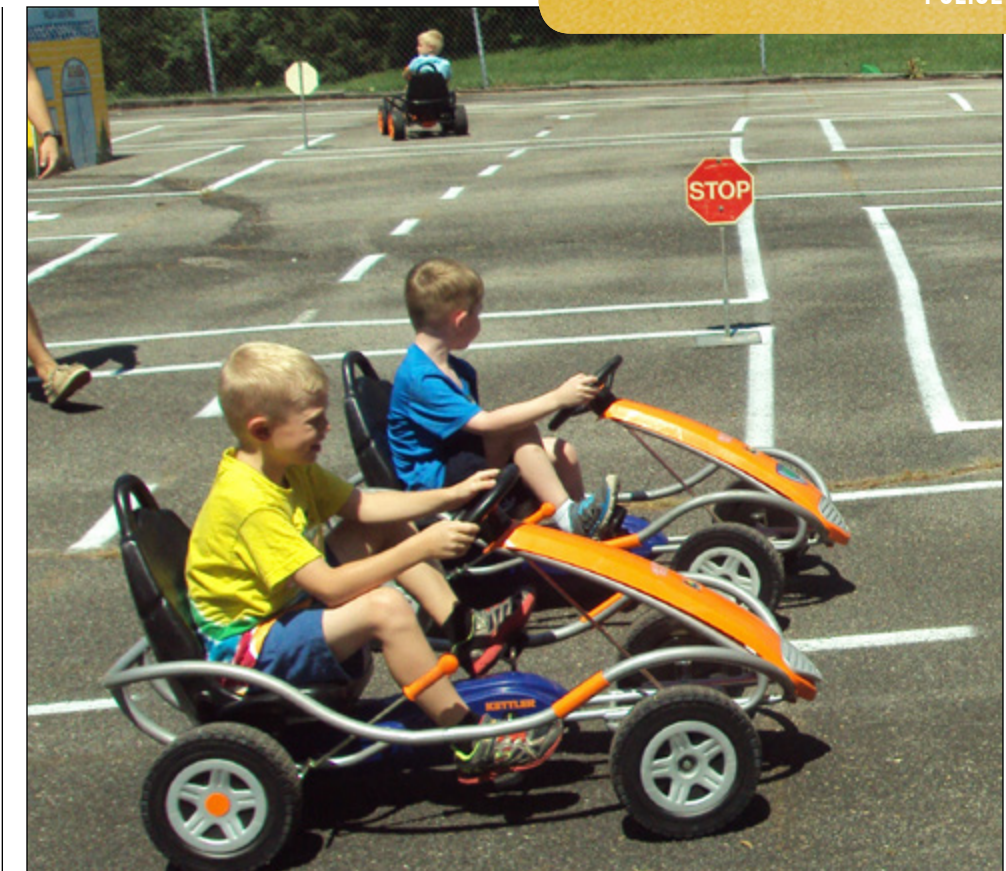
Safety Town is a nationally accredited child accident prevention program that introduces safety awareness and preventive procedures to children.