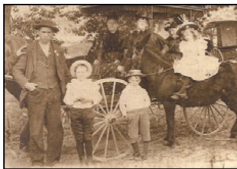
Hyde family near the turn of the 20th century.

West of Bellefontaine was the town of Chesterfield. It was established along Olive Street Road and Wild Horse Creek Road (Old Chesterfield and Baxter Roads today).